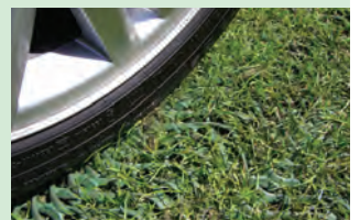
Mesh after installation