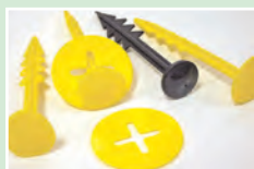
Plastic pegs and parking bay markers / washers