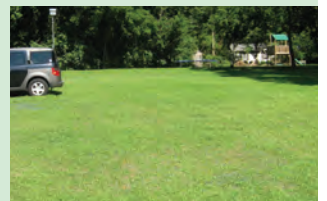
After installation - grass grows through quickly