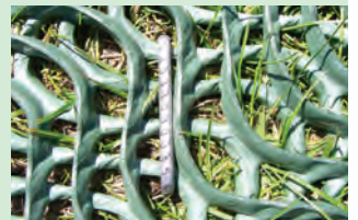
Secured with U-pins