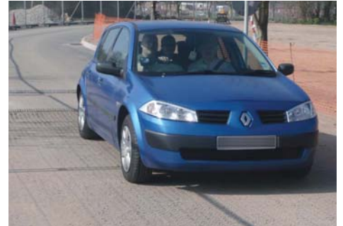
BodPave® used as the vehicle access roads

BodPave® was used in conjunction with GrassProtecta® which was specified for the reinforcement of the car parking areas.