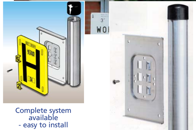
Complete system available - easy to install