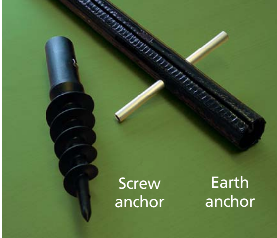
Screw anchor Earth anchor

Other sizes available. Posts can also be finished in blue or yellow